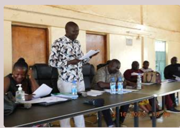
Hon. Obiero Otare, Chairperson Sectoral Committee on lands, physical planning, Surveying and Housing taking reading through the Spartial plan to the public during a recent public participation.

The Siaya County Finance Bill, 2022 also went through public participation. The Bill seek to set rates and taxes for revenue raising purposes. Article 28 highlights on the tax exemption on the person living with disabilities (PWDS).