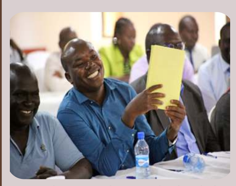
Hon. Booker Bonyo and Hon. Francis Otiato sharing alight moment during the joint meeting.