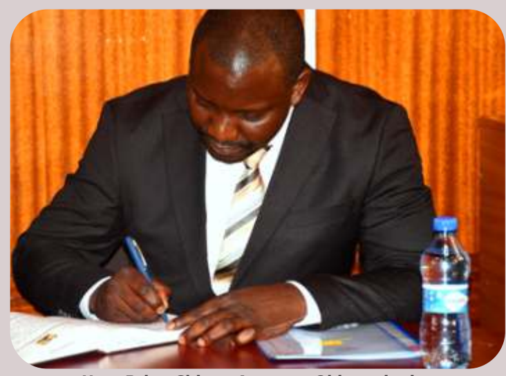
Hon. Brian Chieng Anyango Obiero signing oath of office documents