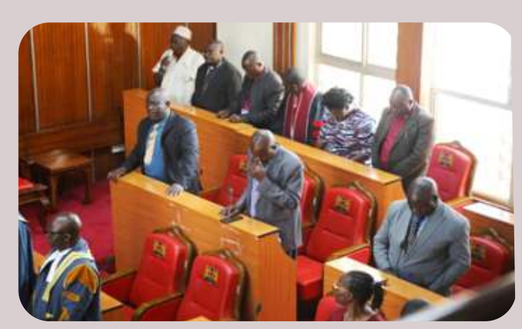
Hon. Members and the Clergy during the resumption of House business after along recess.