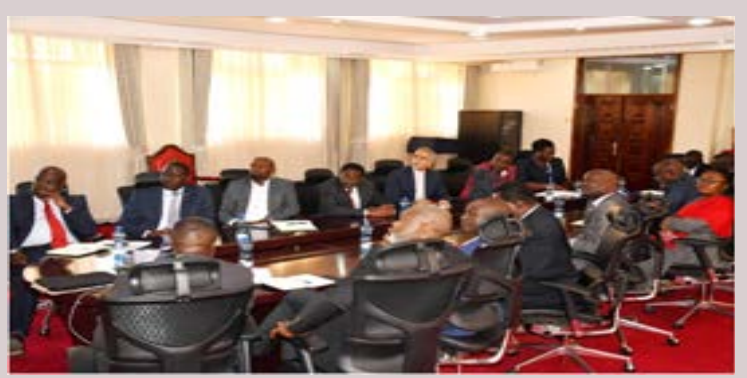
The Siaya County leadership following a presentation during the visit by Jafar Barmaki.