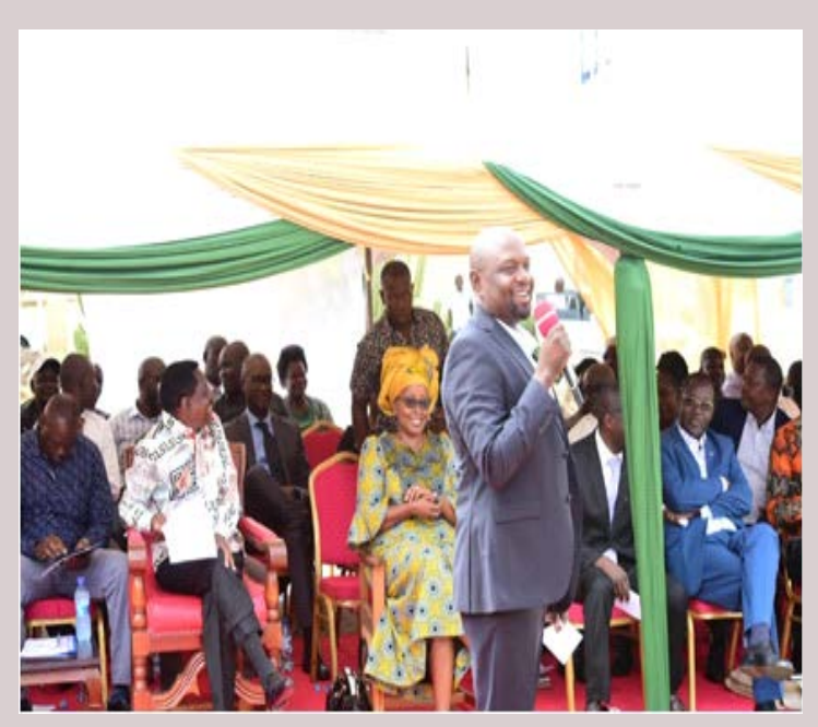
Speaker, Hon. George Okode addressing the ECD teachers at the Govenor's compound

"You play a significant role in the growth of our children. You nurture and mould them for a greater future. You possess the unique ability to positively influence their physical, emotional and intellectual growth. The shift from contractual to permanent and pensionable terms of employment is aimed at motivating you and promoting quality early childhood education. The ripple effect of this will be improved performance and service delivery," he stated to the teachers.