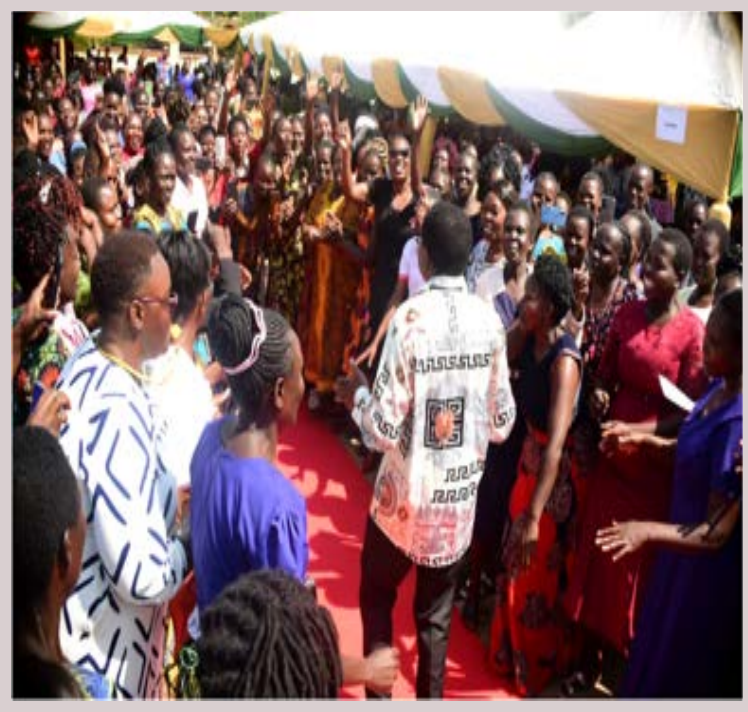
Hon. James Orengo Celebrating with the ECD teachers.