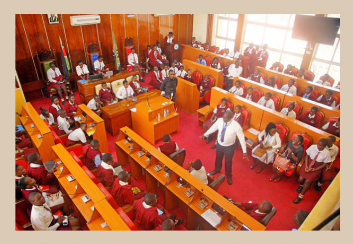
Students from St. Barnabas Secondary School-Kisumu County during a learning session in the chambers.

The educational visits are coupled with a comprehensive guided tour of the Assembly and watching of the live proceedings of the House. Schools that wish to visit the Assembly for learning purposes can place a formal request through the office of the County Assembly Clerk indicating their preferred date of visit.