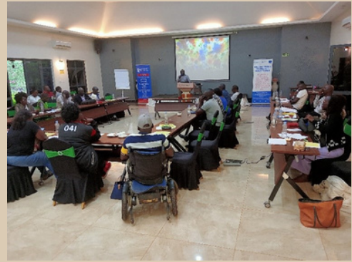
Hon. Arika, Chair education Committee addressing stakeholders