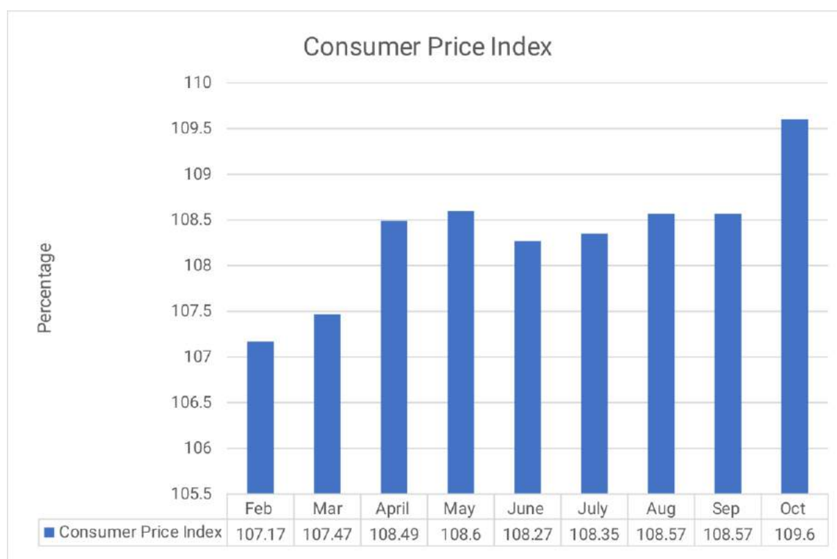
Figure 2: Consumer price index